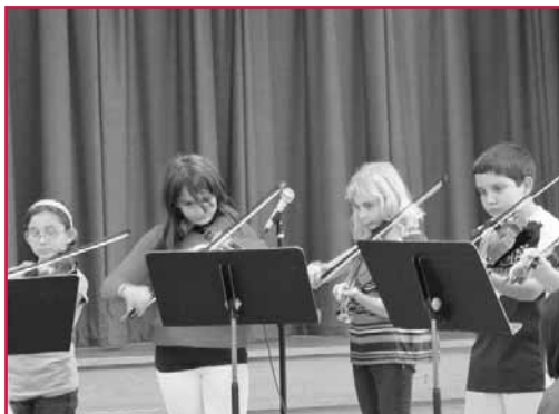
Members of the Ruth C. Kinney string ensemble performed for their veterans.