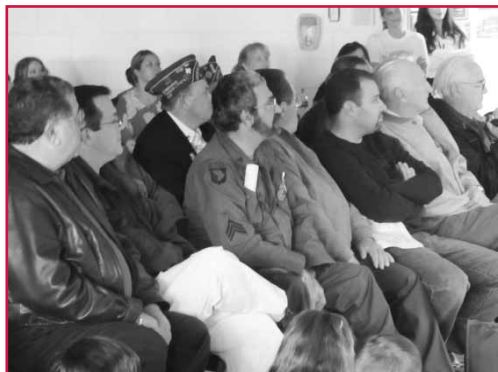
At Connetquot Elementary School veterans looked on as students sang the “Fifty Nifty United States.”