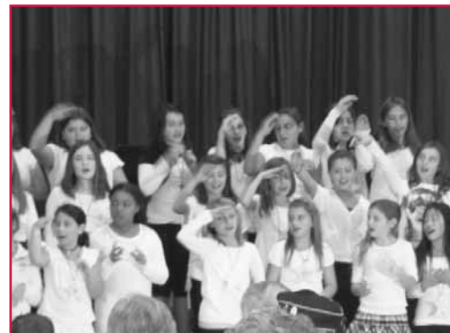
Students at Timber Point Elementary salute veterans and guests.